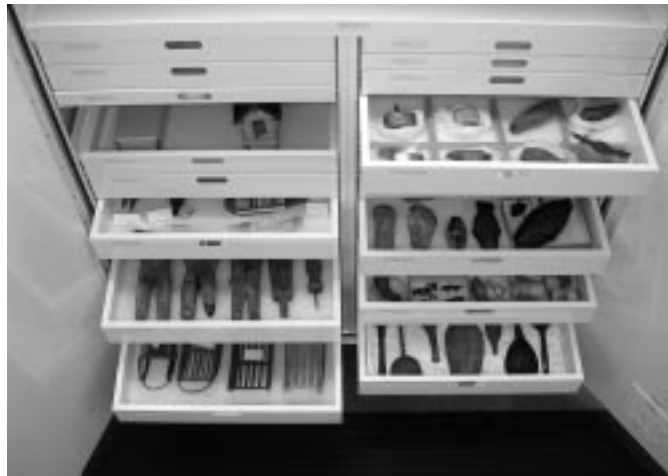
A small sample of the more than 32,000 museum objects now available online.

The online collections database represents years of work cataloging artifacts, a painstaking process originally done on index cards. Museum personnel began entering the catalog into a computerized database starting in the 1980s. This latest phase