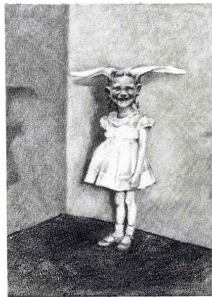
I Have the Capacity for Optimism (detail), by Jane Terzis. Graphite on paper.

The online exhibits combine photographs of the artworks and gallery installations with artist statements and interviews. Numerous other Web exhibits are also available. Visit: http://www.museums.state.ak.us/online.htm