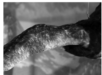
... and wing after dusting.