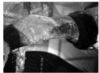
Eagle wing before removing dust...